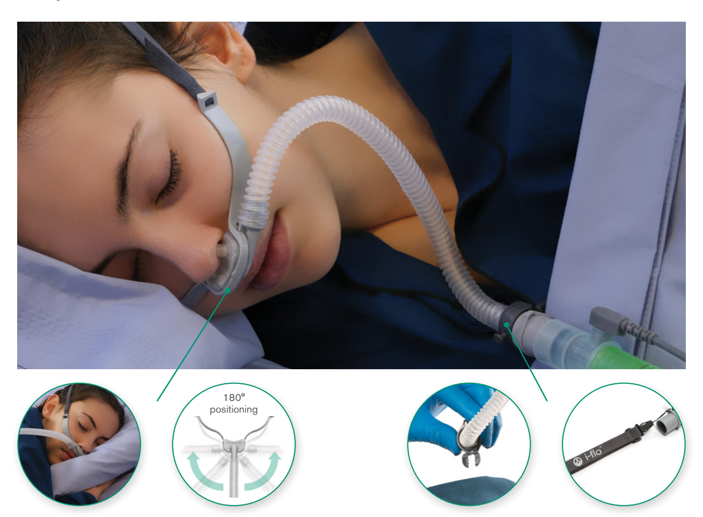
The i-flo's unique, 180° swivel elbow enables easy and convenient positioning of bedside equipment.