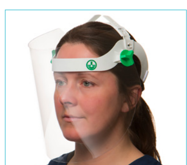
Airway Management • Protective Visor